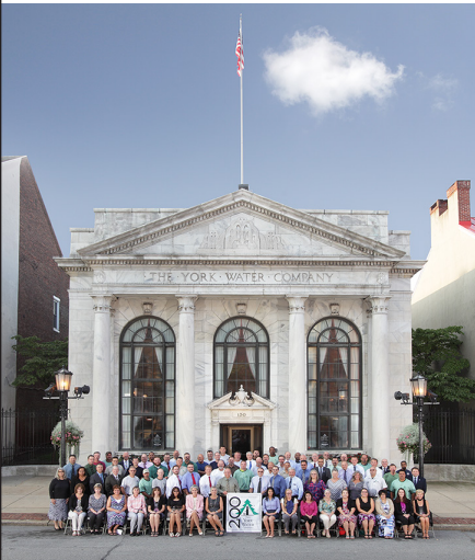
Photo (above): Employees of The York Water Company in front of the Company's Headquarters, built in 1929.